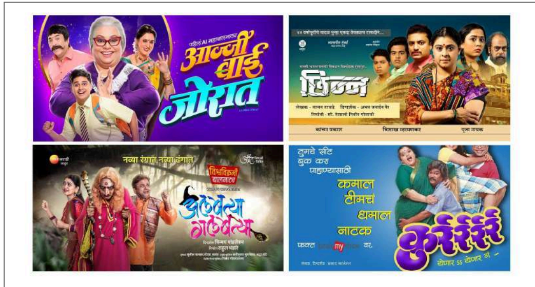
Fig.26 . Collage depicting samples of expressive marathi theater play titles designed by other current designers.

The titles listed above were created by Shedge and are still used in theater advertisements. This demonstrates his significance in this field and his enduring influence. His enormous portfolio of work serves as a tool for visual storytelling and has managed to secure a position in the market that is still relevant today.