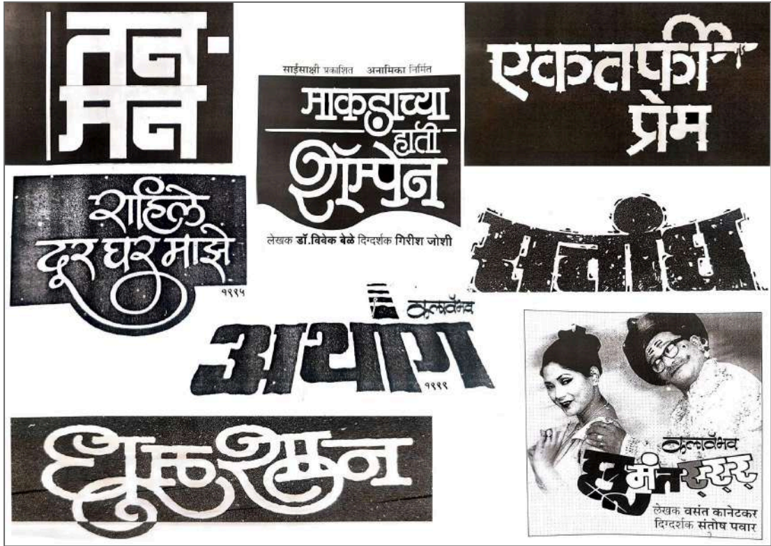
Fig.4. Collage depicting various samples of composition-oriented, expressive Marathi theater play titles designed by Shedge.