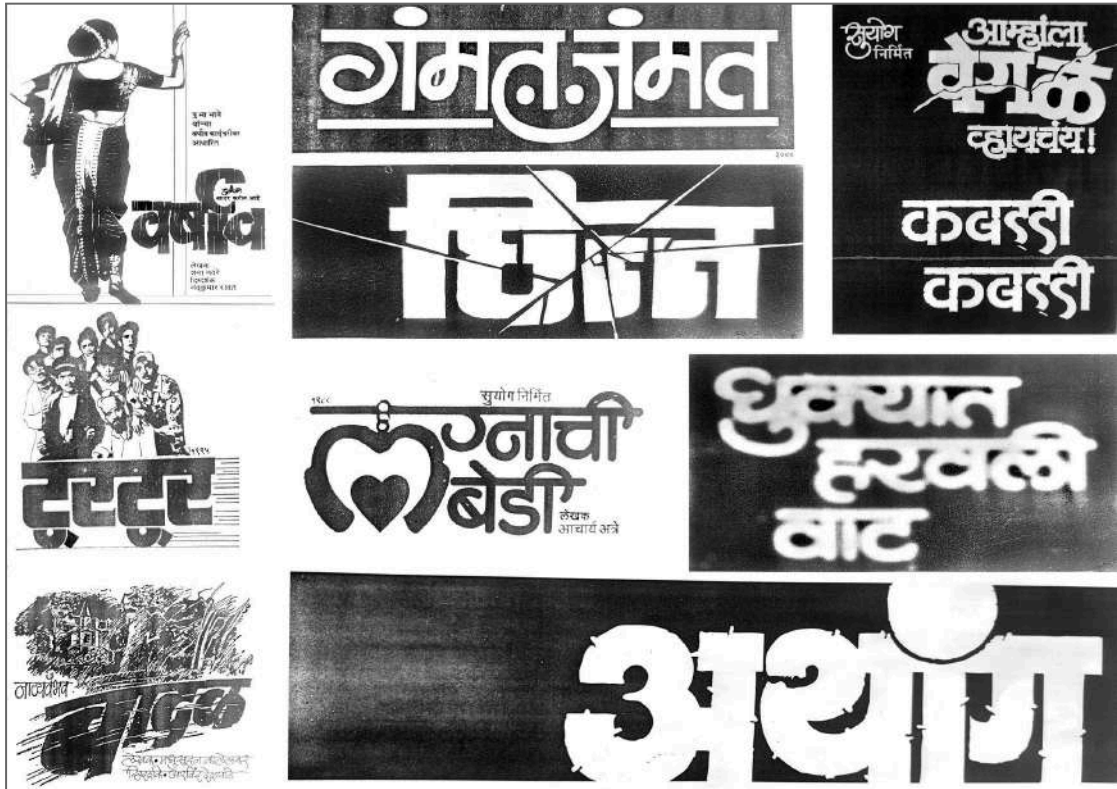
Fig.7. Collage depicting samples of symbolic expressive Marathi theater play titles designed by Shedge.

Incorporating symbolic elements adds depth to the story. In his lettering designs, Shedge often incorporates symbolic elements to express deeper significance. These carefully selected symbols align with the narrative themes, offering readers a multi-layered experience.