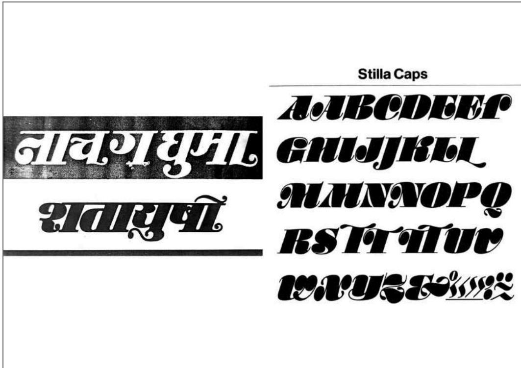
Fig.10. Comparisons of Shedge’s Marathi lettering and the original Stilla Caps Latin-script letterforms he based them on.

The extensive application of serifs in his Marathi title designs with varying weights, such as bold and light, serves as evidence of Latin visual structure influence.