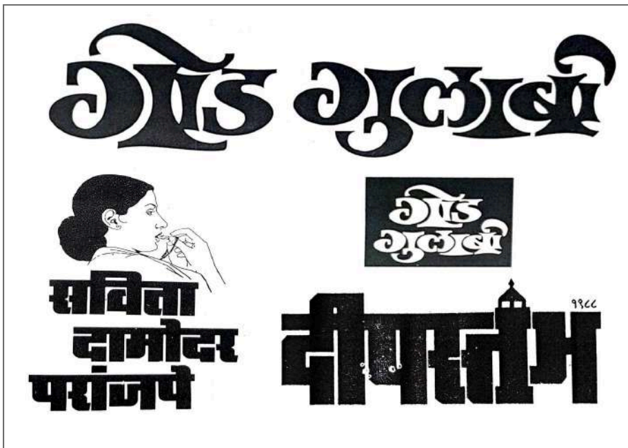
Fig.5. Collage depicting samples of expressive Marathi theater play titles designed by Shedge, emphasizing expressiveness through color.

The use of black and white color schemes in Shedge's lettering has significantly contributed to storytelling.