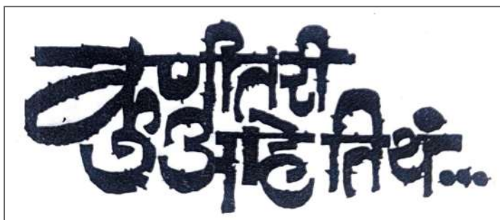
Fig.19 . Title depicting horror through lettering, designed by Shedge.

The curvy, playful, handwritten, and dynamic spacing of letters in titles evokes cheerful sentiments through its look and feel.