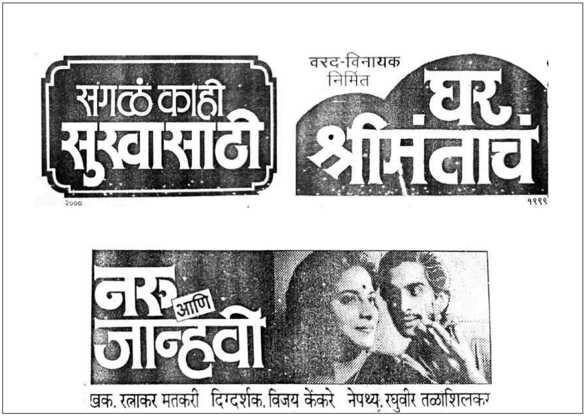
Fig.16. Style 3 : Frequently used style in title design