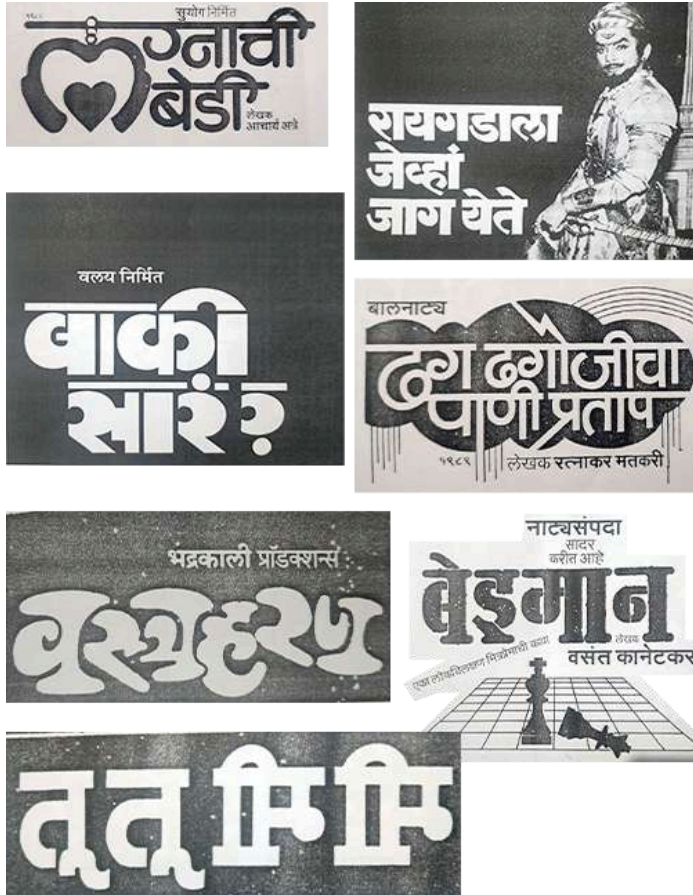
Fig.1. Collage depicting various samples of expressive Marathi theater play titles designed by Shedge.

His creative approach to typography has redefined how stories are told visually through suggestive lettering as an art form that communicates the essence of the story. His ability to convey meaning through typographic titles is not only about aesthetics; it's about creating a visual language that resonates with the narrative's core. During the pre-computer era, advertising in the media was expanding to Indian languages. However, little variety of lettering in Devanagari script was available at the time. In order to accomplish this task, it was necessary to have a transliteration in Devanagari script that could communicate the same meaning as English. Shedge introduced Devanagari alphabets with different weights (bold, light), similar to the serif and sans-serif alphabets in English. This completely changed the world of lettering in advertising (Wikipedia contributors, 2022). He contributed significantly to the transformation of Marathi theater's play ads. Drama and Shedge's advertisements had a cordial relationship long before the idea of drama as a "communication" with the audience gained popularity. Even before actors-directors and playwrights, Kamal Shedge was the first literary artist to gain the audience's faith in drama through his expressive title designs (Kamal Shedge, 2002).