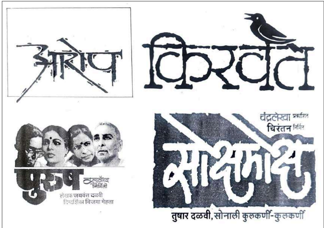
Fig.20.Collage evoking aggressive emotions designed by Shedge.

The bold, sharp-edged, aggressive brush strokes, thick strokes, broken letterforms, and splattered ink effect resemble aggression.