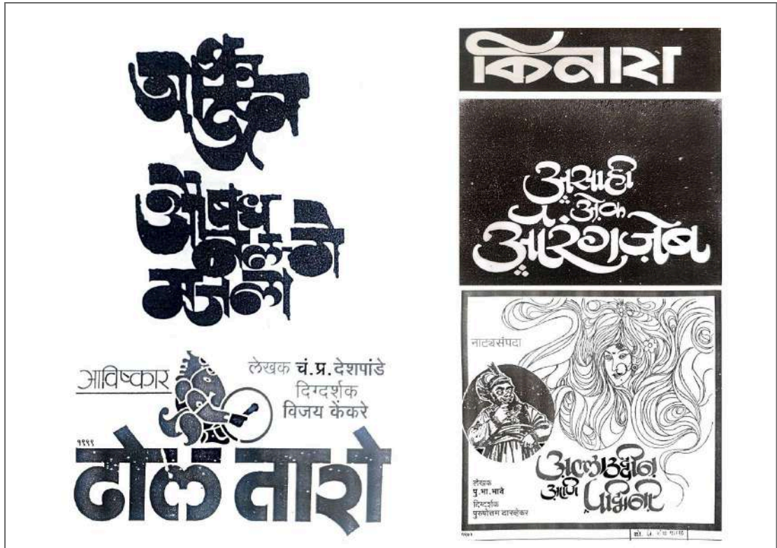
Fig.21 . Collage depicting samples of expressive Marathi theater play titles designed by Shedge inspired by indic scripts.