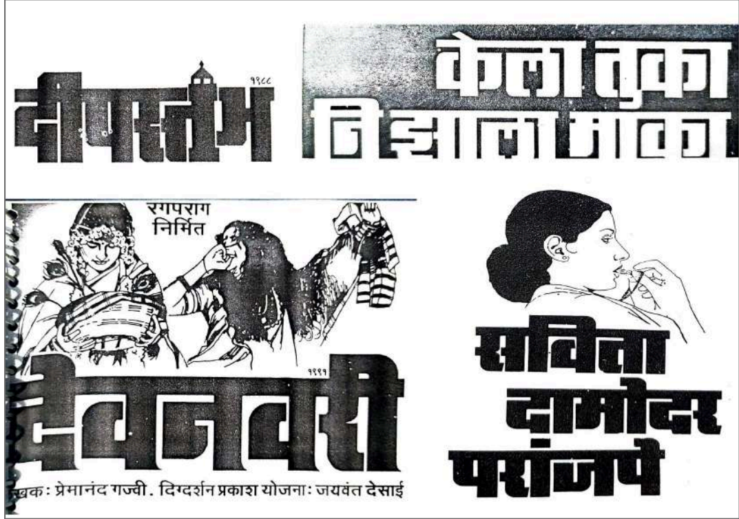
Fig.14. Style 1 : Frequently used style in title design based on basic character sets and mantras designed by Shedge mentioned below.

His work consists of categories that are comparable in terms of look and feel and visual structure that are prominently utilized for his various title designs. Basic character sets and mantras for various styles were used across his designs.