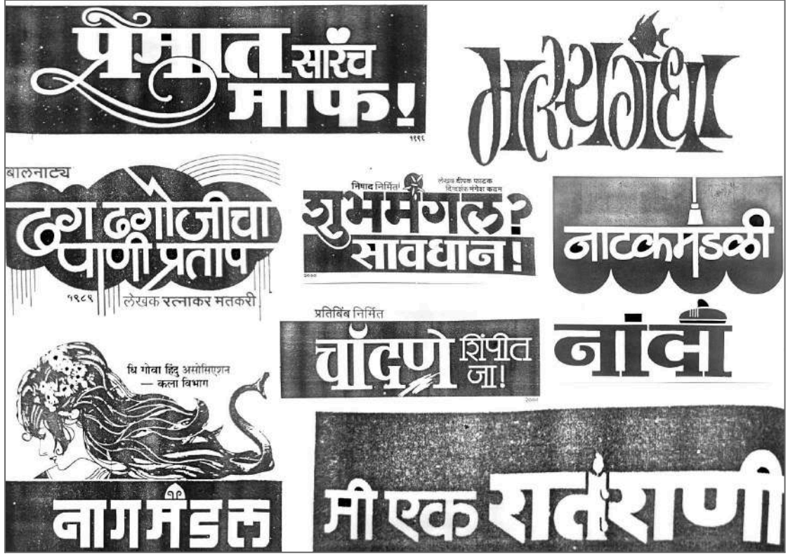
Fig.11. Collage depicting samples of expressive Marathi theater play titles designed by Shedge focused on matra signs.