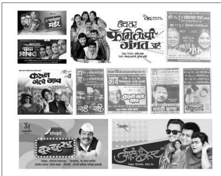
Fig.25 . Collage depicting samples of expressive Marathi theater play titles designed by Kamal Shedge and are still in use.

An examination of Akshar Shedge's title design work reveals the influence of Kamal Shedge's style. Similarities of typographic treatments, expressiveness, composition, matra signs exploration, and elements of visual storytelling play a crucial role in conveying the underlying themes of the play. The visually striking nature of Akshar Shedge's designs not only captures the viewer's attention but also serves as a hint to the meaning of the play, making the design an integral part of the overall theatrical experience.