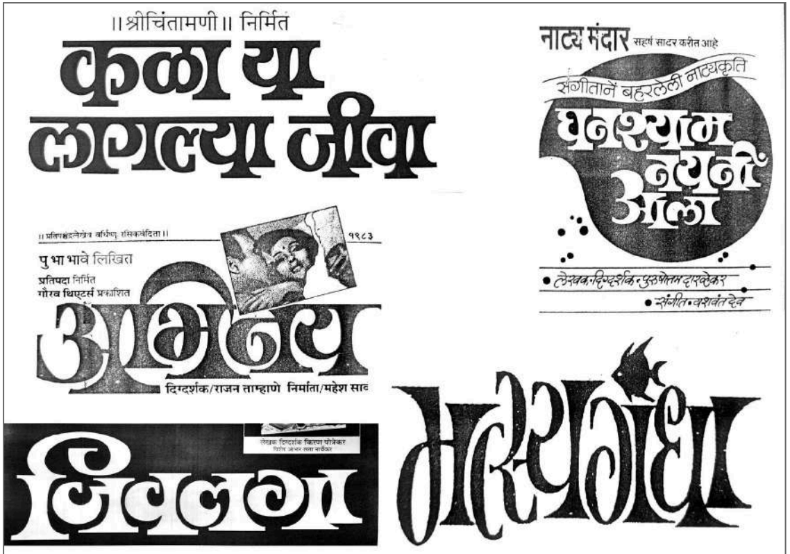
Fig.15. Style 2 : Frequently used style in title design