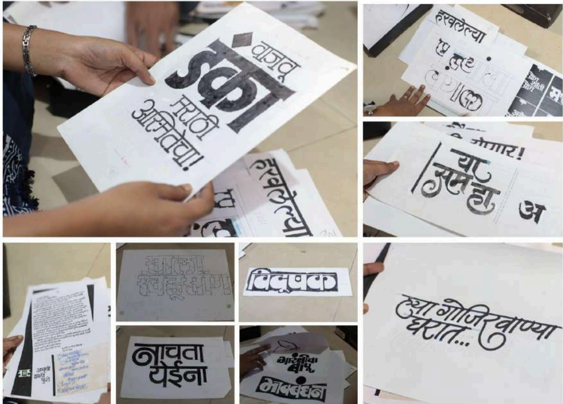
Fig.2. Handwork of titles depicting the cutting and pasting method and use of a grid.

In print media, particularly newspapers, space limitations for theater advertisements have led to the use of compact and bold lettering in his work. This approach maintains readability while accommodating the restricted space available.