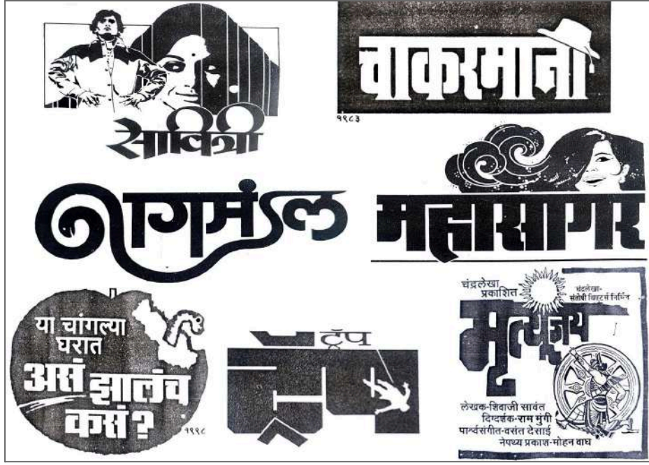
Fig.3. Collage depicting various samples of visual oriented expressive Marathi theater play titles designed by Shedge.

Here, strong, suggestive, and complementing visuals have played a crucial role in evoking emotions and establishing the story's tone, making them vital for engaging the audience and making it more dynamic and memorable.