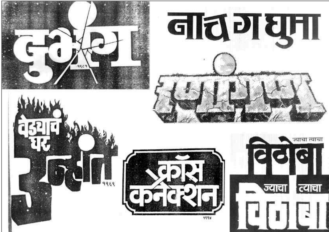
Fig.17. Collage depicting various samples of conceptual Marathi theater play titles designed by Shedge.

Shedge's work is notable for integrating the play's concept into the letterforms, making it a visual representation of the story rather than just a title. This approach strengthens the brand identity by turning the title into a conceptual symbol of the play. He often includes subtle visual cues in his lettering to suggest thematic elements, inviting audiences to think and engage with the typography.