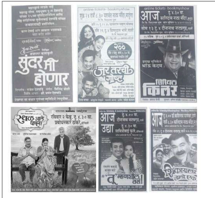
Fig.24 . Collage depicting samples of current expressive marathi theater play titles designed by Akshar Shedge.

An examination of Akshar Shedge's title design work reveals the influence of Kamal Shedge's style. Similarities of typographic treatments, expressiveness, composition, matra signs exploration, and elements of visual storytelling play a crucial role in conveying the underlying themes of the play. The visually striking nature of Akshar Shedge's designs not only captures the viewer's attention but also serves as a hint to the meaning of the play, making the design an integral part of the overall theatrical experience.