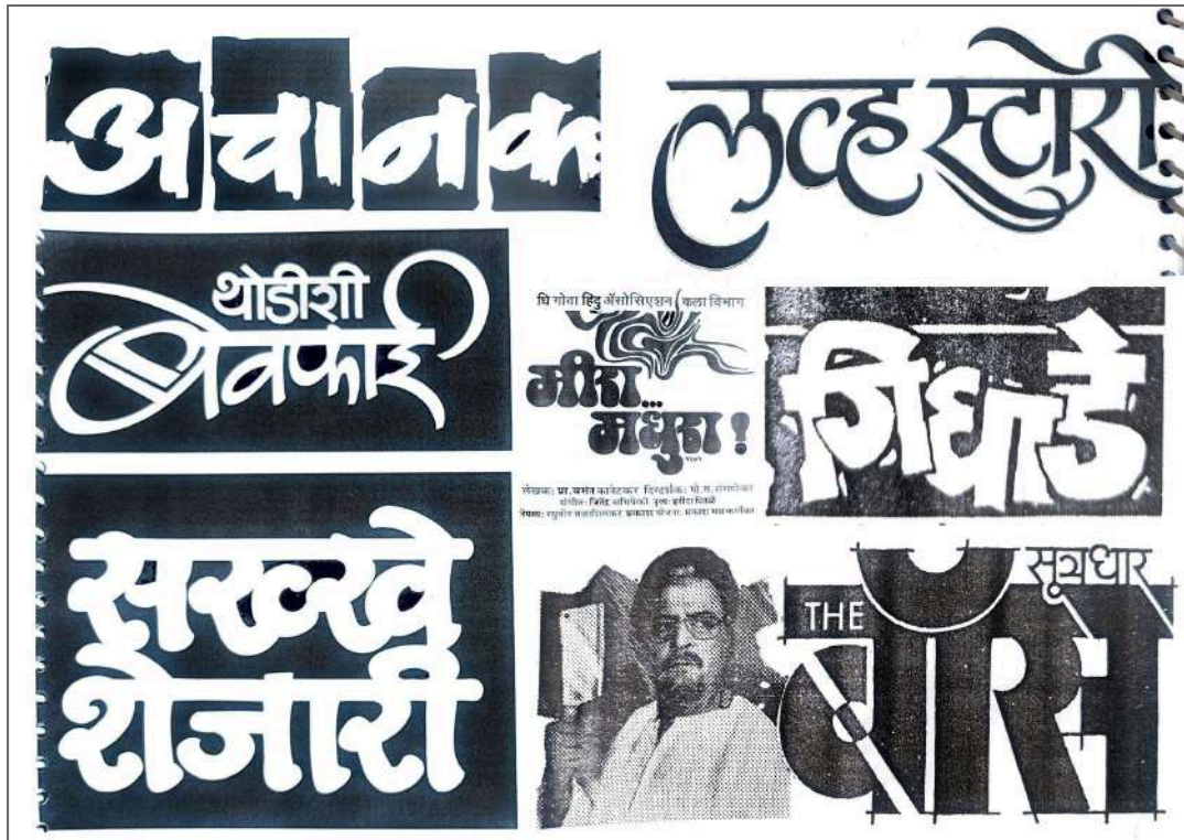
Fig.8.Collage depicting samples of emotive, expressive Marathi theater play titles designed by Shedge.

The deliberate choice of thick, thin, and compact lettering, the manipulation of letterforms, and the integration of abstract shapes all contribute to a cohesive visual experience that evokes different emotions according to the needs of the subject.