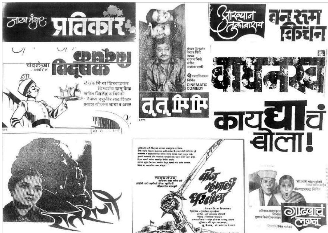
Fig.6.Collage depicting samples of expressive Marathi theater play titles designed by Shedge with different typographic treatments.

When text is involved, typography becomes vital. Shedge's decision-making in designing lettering styles and their weight has influenced how the message is perceived through different typographic treatments. Expressive typography in his titles has enhanced the effective communication that evokes emotions and sets the mood, creating a cohesive visual language that complements the play.