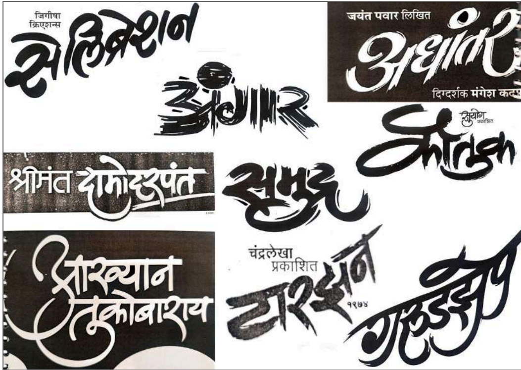
Fig.12. Collage depicting various samples of calligraphic lettering style for Marathi theater play titles designed by Shedge.