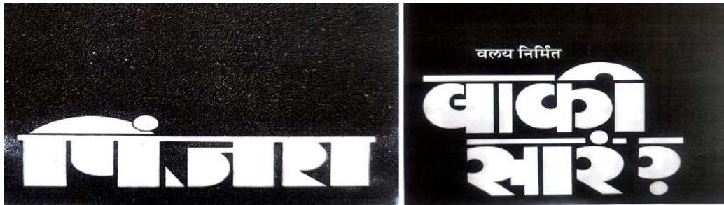
Fig.13. Collage depicting samples of geometrical lettering style for Marathi theater play titles designed by Shedge.

In some of his titles, he has played with the basic geometric shape and with the letters to create interest according to the needs of the subject.