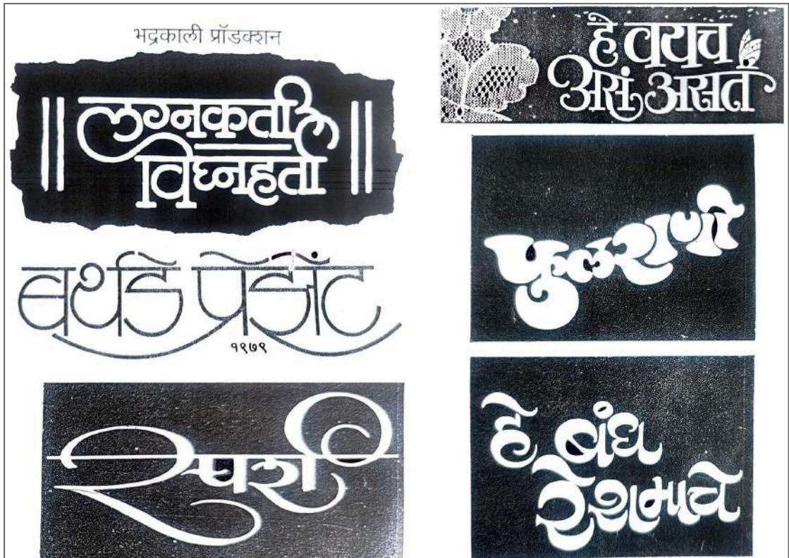
Fig.18. Collage depicting joy through lettering in Marathi theater play titles designed by Shedge.

The curvy, playful, handwritten, and dynamic spacing of letters in titles evokes cheerful sentiments through its look and feel.